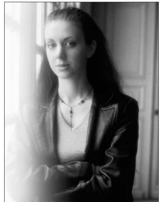
Domestic violence affects families of every income level and every age.