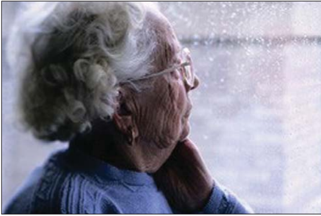
The Victims of Crime Act funding from the State of Georgia Criminal Justice Coordinating Council supports the elder abuse prevention work of the GLSP.

as welfare offices and courthouses. Clients are provided free legal representation, advice and counsel on matters of family law, housing, employment, consumer issues and health care. Since 1971, the GLSP has served approximately 350,000 individuals and families. Last year, the GLSP closed 15,614 cases.