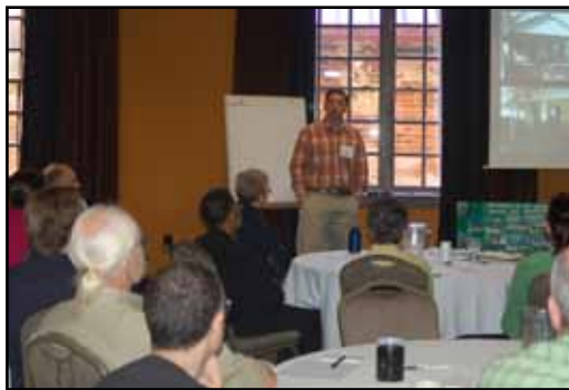
Scenes from the National CLT Network Conference.

Over 150 representatives of community land trusts from across the country converged on Athens for three days of classes, workshops, and tours as the National Community Land Trust Network held its annual conference at the Foundry Park Inn in October, with ALT as the local host. The theme of the conference was "Growing Sustainably: From the Roots Up," and speakers and panelists brought a historical and environmental perspective to the work of CLTs. A highlight was the keynote address by Shirley Sherrod, the new U.S. Department of Agriculture Director of Rural Development for Georgia. Shirley recounted her